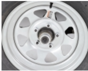
E-Z Lube Axle Offers convenient wheel bearing lubrication thru zerk fittings.