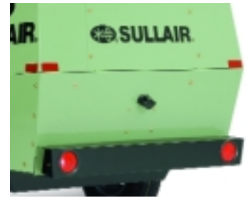
Rear Bumper Features recessed tail lights and license plate light.