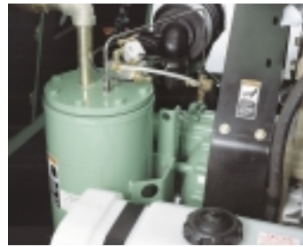
Rotary Screw Compressor Single-stage, fluid flooded. Cast iron housing is dimensionally stable, thick-walled and machined to close tolerances.