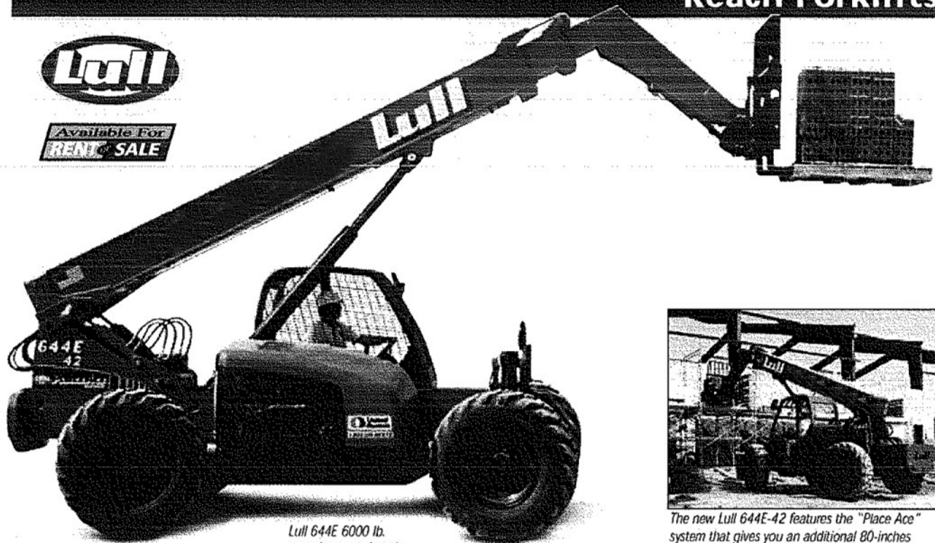
Lull 644E 6000 lb. capacity reach forklift.