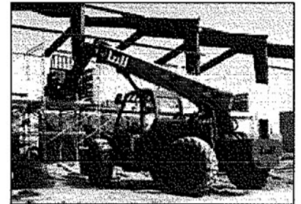
The new Lull 644E-42 features the "Place Ace" system that gives you an additional 80-inches of forward reach by sliding the entire boom forward.