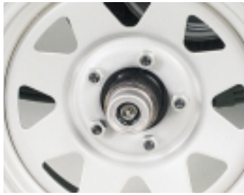
E-Z Lube Axle Offers convenient wheel bearing lubrication thru zerk fittings.