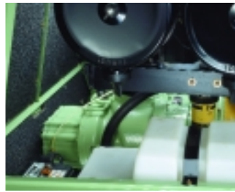
Rotary Screw Compressor Single-stage, fluid flooded. Cast iron housing is dimensionally stable, thick-walled and machined to close tolerances.