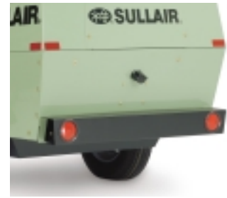
Rear Bumper Features recessed tail lights and license plate light.